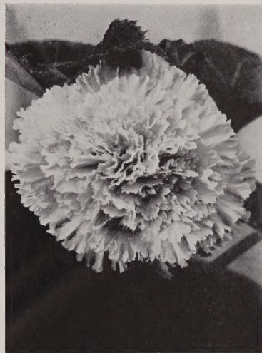
Fimbriata or Carnation Type

Begonia Martiana Grandiflora or Hollyhock type . . . A very interesting and pretty species, useful for conservatory decoration and particularly adapted to bedding. It is a tuberous kind with single rosy pink flowers growing from 3 to 4 feet in height indoors. The flowers are freely produced on long